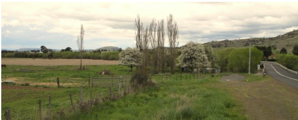
Part of Tamplin's Block looking toward Jordan River, Broadmarsh/Bagdad area Tasmania.