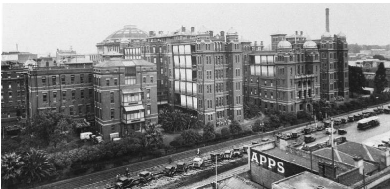
The Royal Melbourne Hospital on Lonsdale Street c1920s.