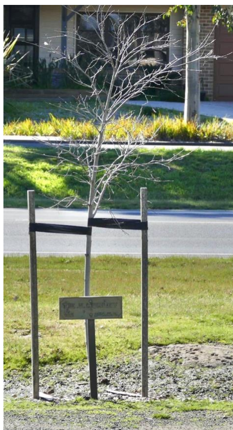
The bronze plaque on Victor's tree today. These were made in 1934 to replace the earlier ones in the 1917 photograph.