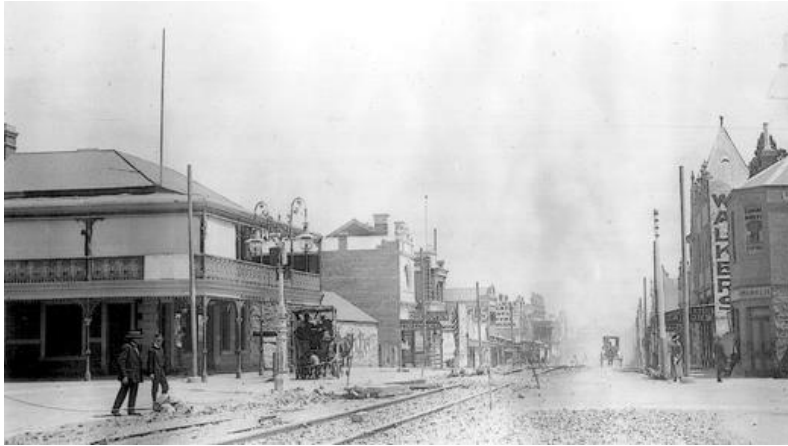
Sydney Road Coburg, looking south from Bell Street c1915 when the Skidmores lived in the suburb.