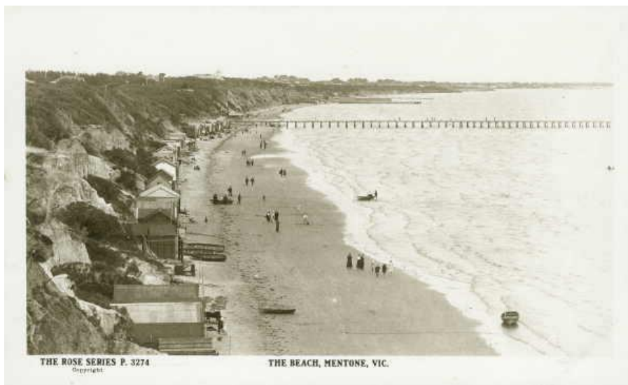
Mentone Beach c1920.