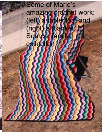
Some of Marie's amazing crochet work: (left) a tablecloth and (right) a blanket.