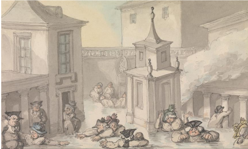
The Bath watercolour by Thomas Rowlandson from Comforts of Bath 1798