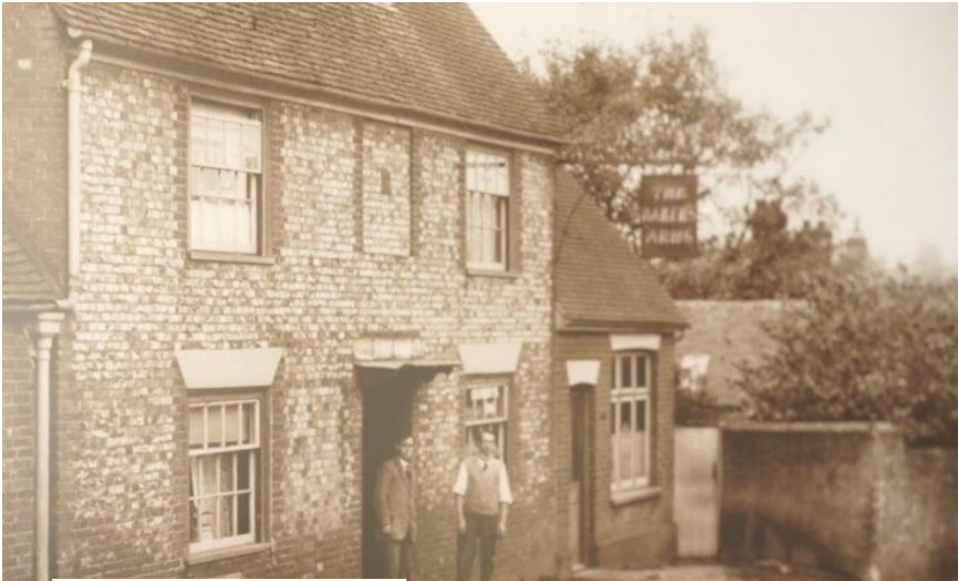
The Baker's Arms, Droxford today.