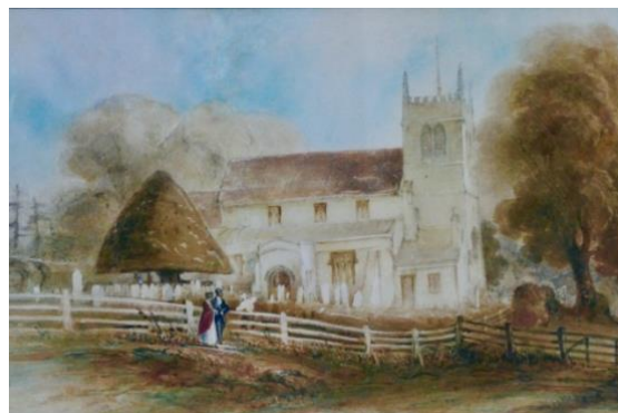
Below: Painting of the church in St. Mary's, date and artist unknown.