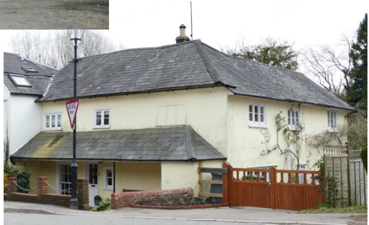
Right: the same house today.