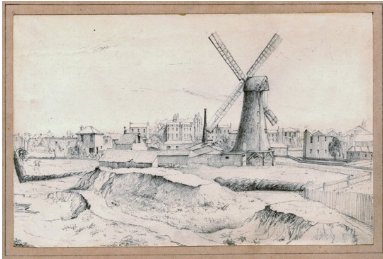
Brixton Windmill (Ashby's Mill) and Brixton in the 1860s.

Mention Brixton and we probably think of the Brixton riots of the 1980s, or today's active multicultural suburban Brixton. However, in the early 19 th century Brixton was very much a semi-rural community, mostly small farms and little clusters of cottages. A distinguishing feature would have been the several windmills, but only one remains today - Ashby's Mill.