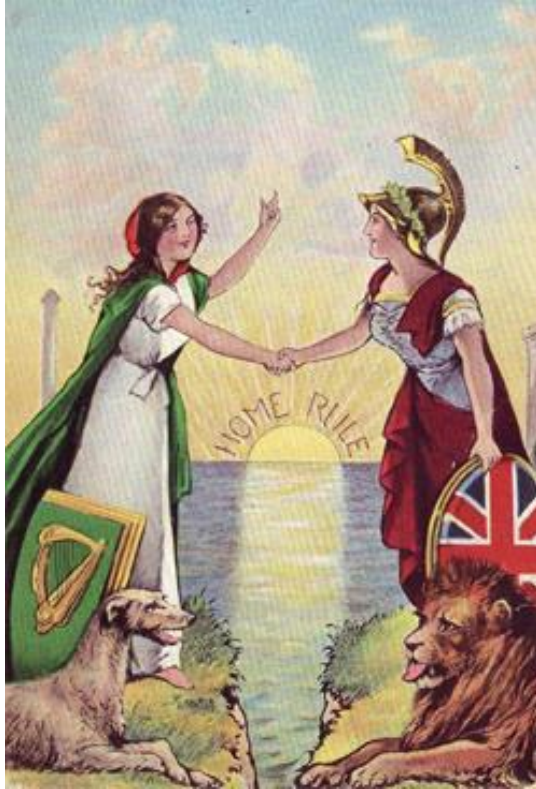
Poster illustrating support for Home Rule from English women for Irish women

such as supporting Irish Independence, reform in the Congo, joining the Society of Friends of Russian Freedom (1907), opposing the South African segregationist Native Land Act (1913), opposing the Boer War and supporting indigenous minorities under colonial rule through the Anti-Slavery and Aborigines' Protection Society.