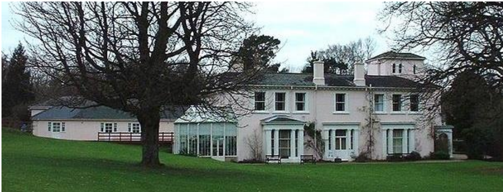
Dunford House , near Midhurst, Sussex.

'The poor lady ... makes fretful complaints if a single bush is cut down or a stone shifted, whilst she vehemently resents the high spirits of the students ... not to mention the opinions of some of the lecturers' 4 .