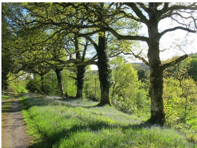
This page and the next: The beautiful trees and wildflowers of the Bargaly Paradise in springtime.