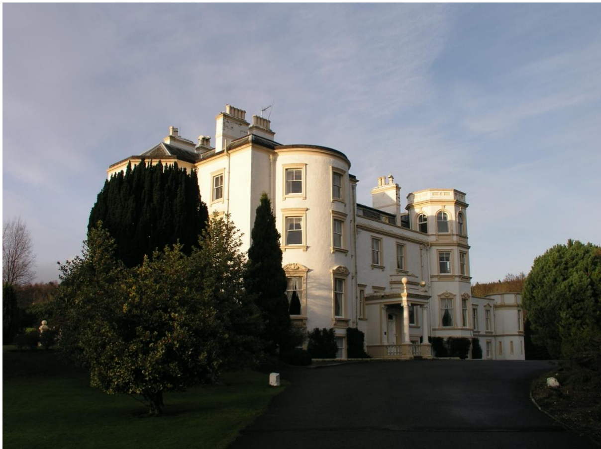
Kirroughtree House (built 1719), Newton Stewart, Wigtownshire, now a hotel.