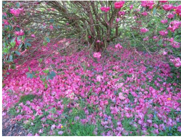
Bargaly Paradise in spring.