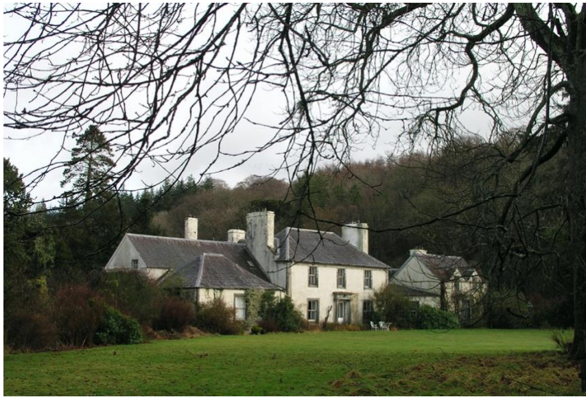
Left: Bargaly House . Below: An exotic Monkey Puzzle tree at Bargaly . Photos: Euan McGillivray 2007