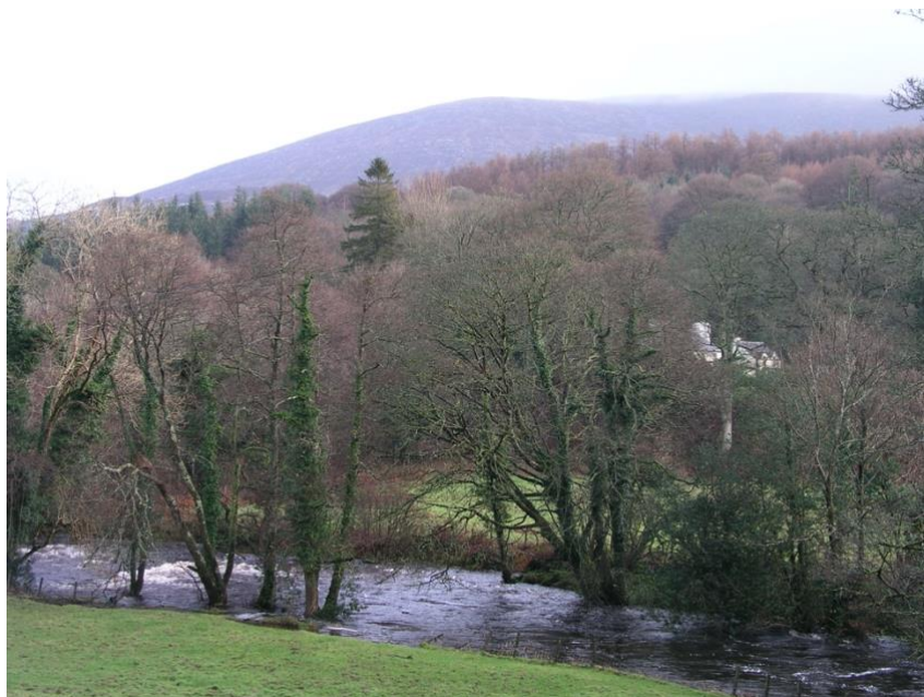
Above: The Palnure Burn with Bargaly seen through the trees, looking up to Craig's Head and Doon Hill.

'The valley of Bargaly is a wild glen traversed from end to end by a little river called the Palnure Burn, which takes its rise in the high marshy grounds of New Galloway and ultimately falls into the river Cree near Wigtown Bay. It winds along a rocky bed between precipitous hills rising, both on the east and west, to a height of some 600 feet. The river bank is fringed with trees throughout its course and here and there, in the loops of the stream, are flat patches of green meadow land which become narrower and less frequent as the site of Bargaly House is approached. At this point the hills draw together and increase in steepness, the stream flowing in a narrow ravine between the frowning heights of Craig's Head and Doon Hill which screen the valley completely from east to west.'