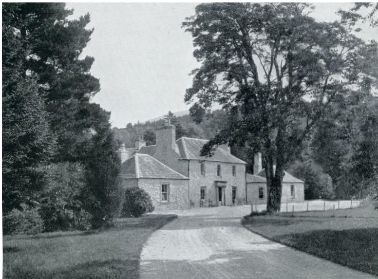
Left: Bargaly House Photo: c1902 Source: The History of Our Family - The Rogers of West Meon Julian Rogers 1902. Below: Sundial in the Bargaly garden said to be made by Andrew Heron. Photo: Euan McGillivray 2007

The house was very simple in design (two wings were added after Andrew died) and built from local materials. The stone came from a quarry on the east side of the garden. On the hillsides and around the house Andrew planted oaks, beeches, hornbeams, flowering ashes, limes and variegated hollies (some hollies 26 feet high). Some of these trees grew to enormous sizes. When measured a century after being planted, one hornbeam measured 10 feet in circumference and an oak tree measured 12 feet in circumference and 60 feet high. A description of the plantation can be found in Loudon's Arboretum et Fruticetum Britannicum 3 .