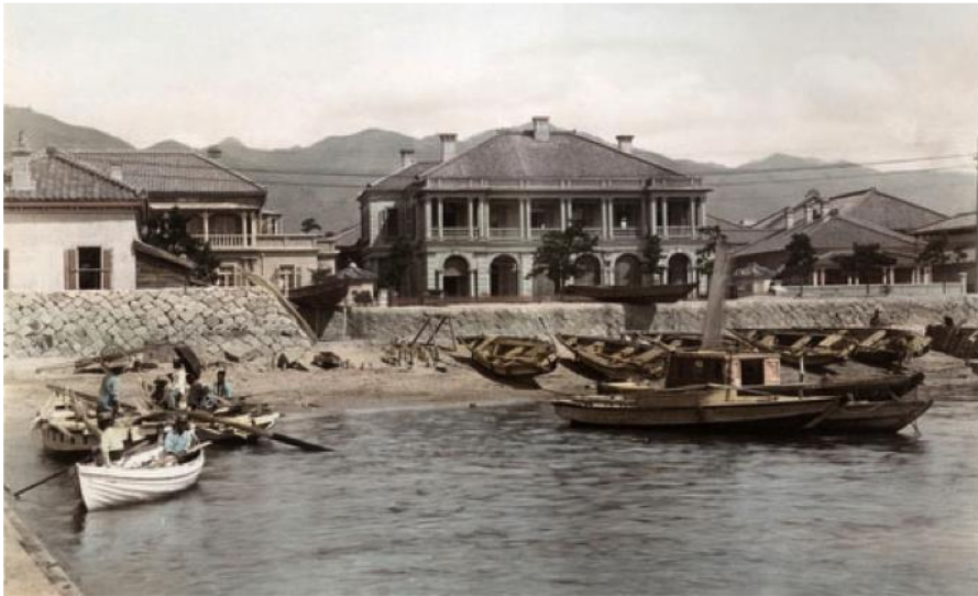
Houses at the Bund (embankment) Kobe (Hyogo) 1880s.