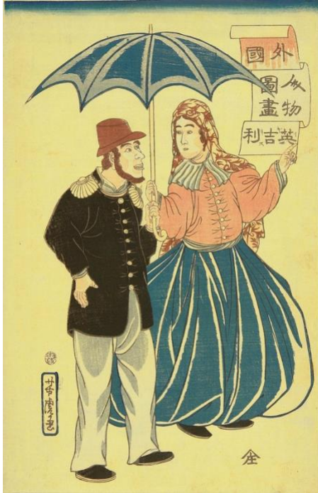
English Couple 1860 Woodblock print by Utagawa Yoshitora (1836-1880).