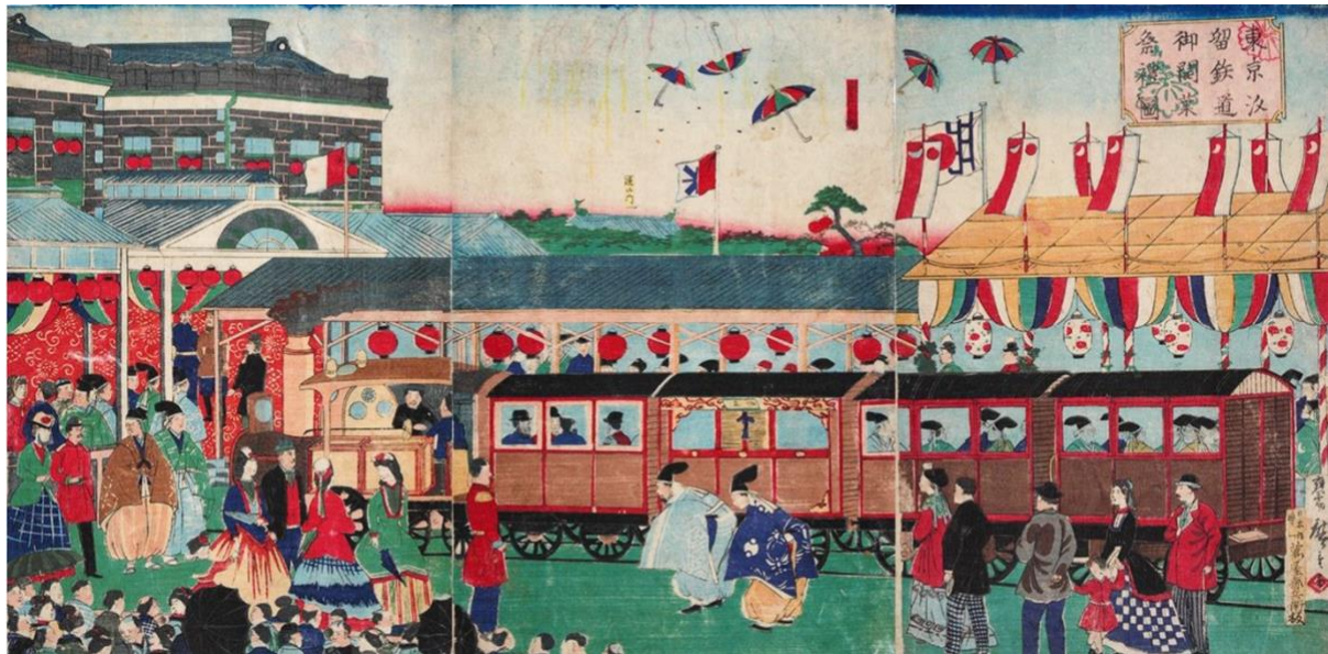
Japan's first rail service, from Tokyo's Shinbashi to Yokohama, 1872. Utagawa Hiroshige III, 1872. Print.