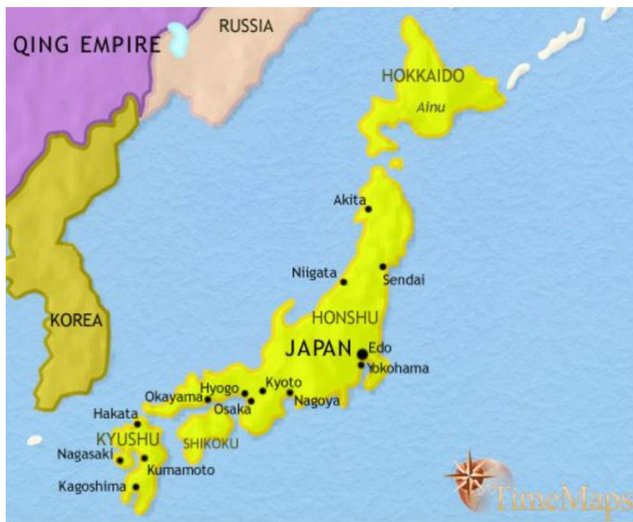
Japan in 1871, showing Hyogo, Yokohama and Nagasaki. Edo is Tokyo.