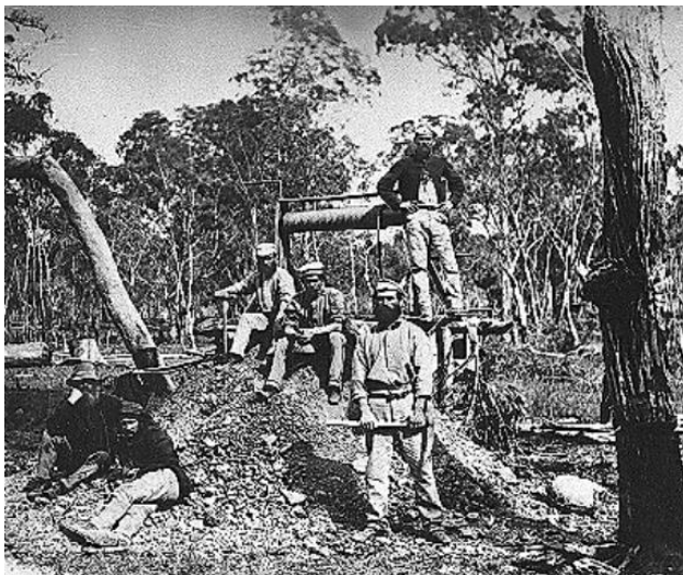
Gold miners near Stuart Town, New South Wales, 1871.

open a new hotel, the Masonic Arms , not far from Molong (near Stuart Town) at the Stoney Creek diggings, taking the boys with him. But their new abode only lasted just on a year. Apart from the lack of reliable business, staying at Stoney Creek was probably not in the boys' best interests. There was no proper school there at the time and it was in the midst of gold-digging frenzy, in a very male dominated, rough and risky environment - not a good influence on the motherless boys.