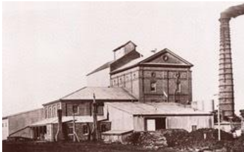
The Mill (at Millthorpe) was built in 1884 for the processing of flour and operated until 1962. The Great Western Milling Company was formed by local shareholders and became one of the biggest millers in the state employing many local people. This impressive mill building was demolished in 1974.