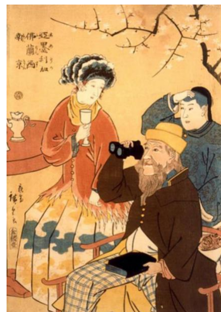
American, French, Chinese 1860 Woodblock print by Utagawa Hiroshige II. Source: nippon.com (Hagi Uragami Museum)

In the recent past, at Yokohama, there had been problems when foreigners and Japanese mixed - on the whole due to cultural misunderstandings. Keen to avoid this problem at Hyogo (also spelled Hiogo) a settlement was established where foreigners (British, American, Chinese, French, German, Dutch and others 5 ) could live under their own municipal law separate from Japanese law. This gated community (foreigners needed a passport to leave the settlement and Japanese were not permitted to live there) was a way for the Japanese government to keep the foreigners and Japanese culturally and socially apart yet allow business to continue. A municipal council, including elected representatives as well as foreign consulate representatives, was created to govern the settlement, and Charles was its first superintendent.