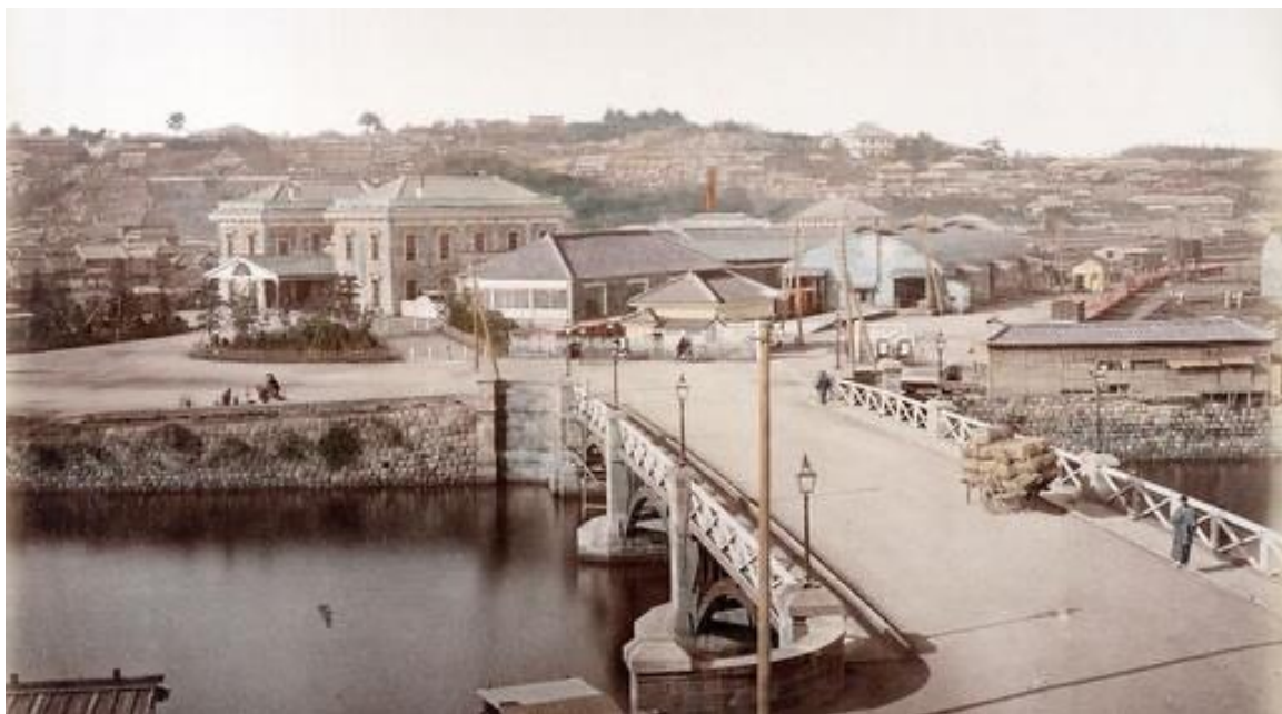
Bentenbashi Station, Yokohama 1873.